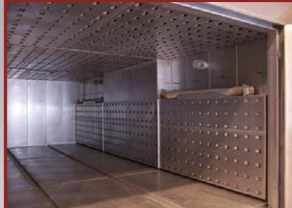
Interior Supply and Return Ducts with Interior Lighting