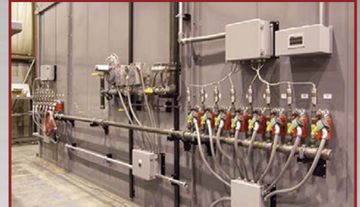
Vacuum Piping System with Pressure Transducer and Thermocouple Jack Panel