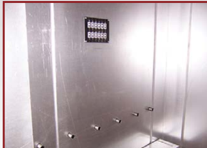
Interior Thermocouple Jack Panel and Vacuum Stubs