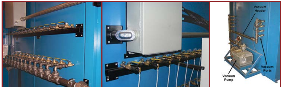
Vacuum Lines for Composite Bag Applications