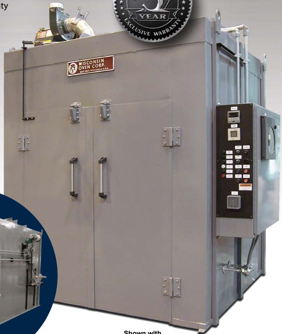
Shown with optional upgrades